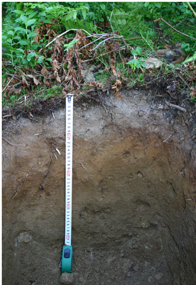
Fig. 3. Illuvial-ferric podzol in a blueberry green-moss forest. By A. D. Bovkunov

Green moss forests have been formed under the influence of clear or selective cutting, as well as fires. Some traces of past fires may be detected in them in the form of scorch marks on old pines or cedars and soil composition. Soil types here are predominantly illuvial- ferric, illuvial-humus-ferric podzols and podzolic soils (Fig. 3). The humus thickness is very small or absent altogether. Continuous presence of coal is one of the characteristic features of the soil