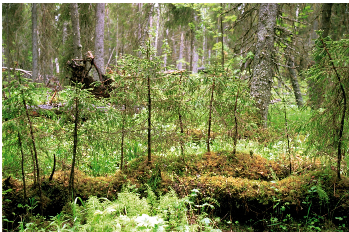
Fig. 2. Regeneration of the spruce on the fallen dead wood. National park "Paanaiarvi (North Karelia)". By M. V. Bobrovsky