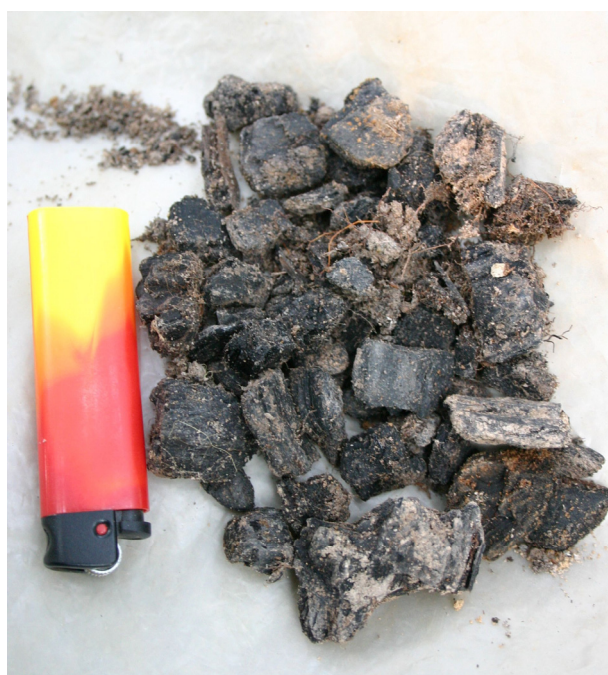
Fig. 4. Coals from soil cuts of spruce and fir green-moss forests. Pechora-Ilych Nature Reserve.

(Fig. 4). In most soils foliated coal was encountered in the form of a layer on the borderline between the forest floor and the mineral horizon. The coal layer thickness occasionally reaches several centimeters, which testifies to multiple crown and surface fires in the past [9]. The anthropogenic nature of most fires in boreal forests has been repeatedly confirmed by observations and recorded in materials produced by nature reserves [3, 10].