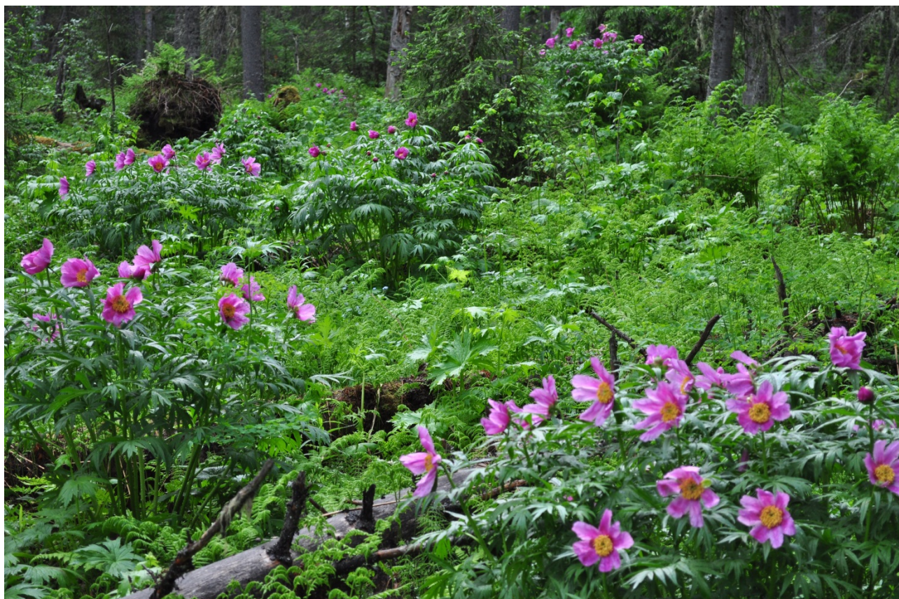
Fig. 7. Tall-herb dark-coniferous forest in the phase of peony flowering. Pechora-Ilych Nature Reserve.

Dark-coniferous tall-herb forests differ drastically from green-moss forests according to the majority of features. Their stands of trees are uneven-aged and comprise uneven-aged groups of trees. The prevalent tree species are spruce or spruce and fir jointly; populations of these species are normal full-member ones, which testifies to the stable flow of generations. Birch, poplar, and other deciduous trees as well as the Siberian pine grow in small numbers in the Cis-Ural region, the Urals and West Siberia. In these forests accumulations of trees of various size and age are interspersed with large glades, dominated by beautifully flowering tall herbs.