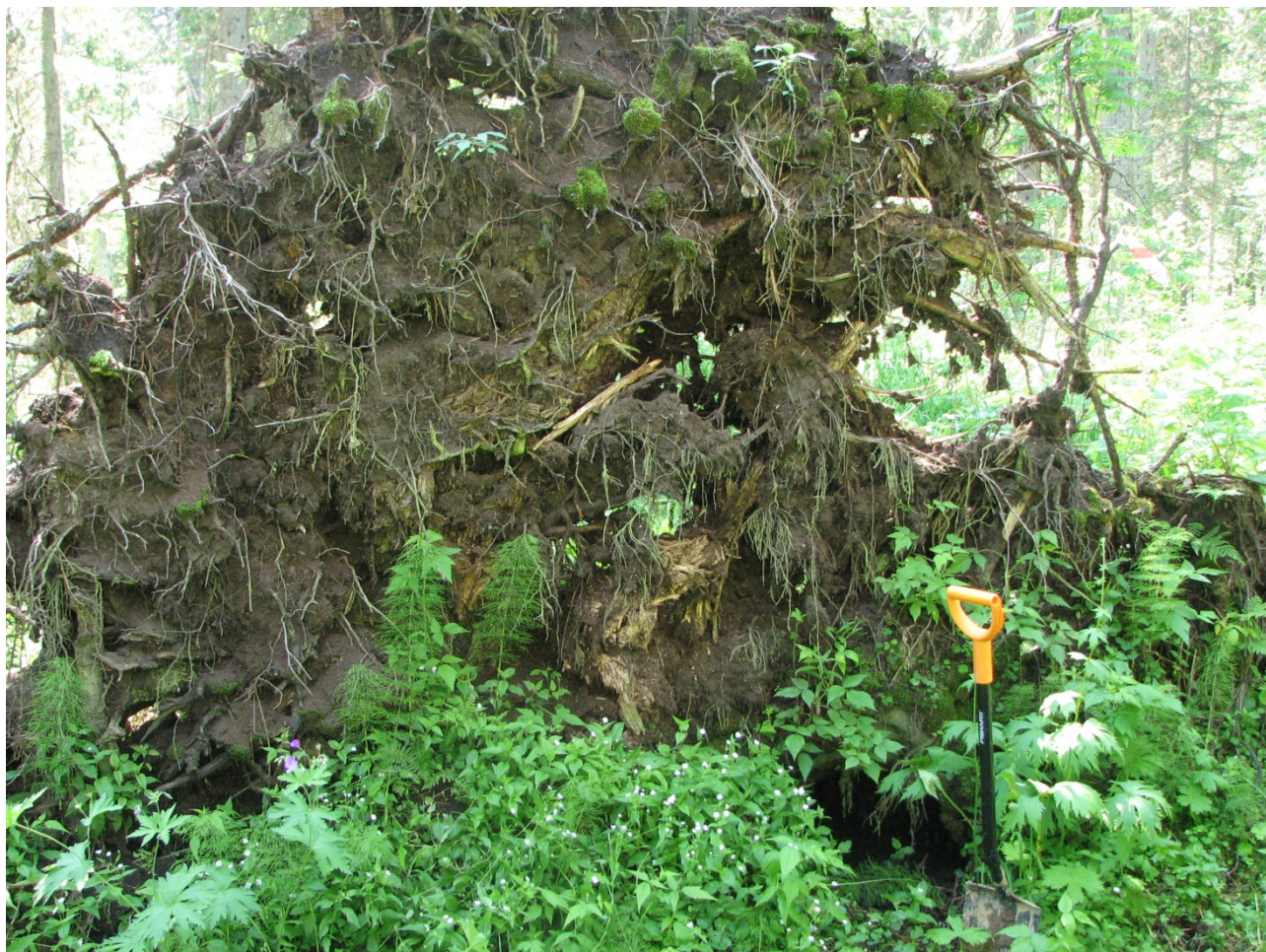
Fig. 9. Elements of the soil complex attributable to windthrow: a mound and a pit in a tall-herb forest. Pechora-Ilych Nature Reserve. By A. A. Aleinikov

ow-grass ( Poa pratensis ) and others. As fallen dead wood is decomposing, pits and mounds overgrow, the more narrowly specialized species of these microhabitats are replaced with generalist species: the nemoral ones come first, followed by tall-herb ones. As downed dead wood, mounds and pits are being constantly formed, there is always a vast diversity of ecologically distinct vascular plants and mosses in tall-herb forests [15].