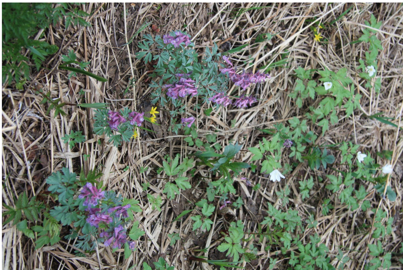
Fig. 8. Ephemeroids: Corydalis bulbosa (L.) DC, yellow Star-of-Bethlehem ( Gagea lutea L. Ker-Gawl.) and Anemone altaica Fisch. ex C.A on a tall-herb forest glade in spring. Pechora-Ilych Nature Reserve.

Nemoral species, and especially ephemeroids, whose above-ground growth is before the canopy formation, are closely connected to broadleaves and aspen in terms of their habitat. Therefore, their presence in dark-coniferous boreal forests looks unexpected. However, the reconstruction of broad-leaf trees' habitats in the late Holocene has demonstrated that they were spread much further to the north than at present [14]. Consequently, we may presume that their presence in dark-coniferous forests marks a wider spread of broadleaves to the north in the past. We have to note that ephemeroids have only been preserved in tall-herb forests which are characterized by rich soils with moisture-holding capacity. They remain mostly on glades where coniferous trees are absent and where in spring and at the beginning of summer, when vegetation is just starting, there is quite enough light.