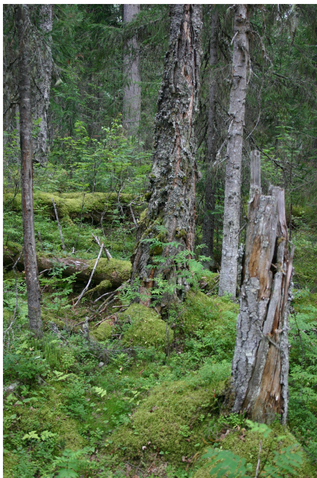
Fig. 1. Overall look of the green-moss spruce forest. National park "Paanaiarvi (North Karelia)". By M. V. Bobrovsky