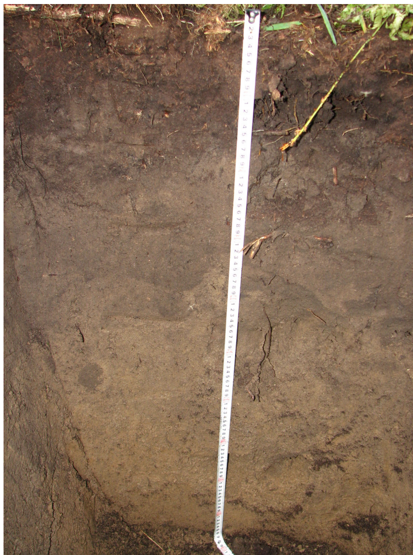
Fig. 10. Coarse-humus brown soil in a tall-herb forest. Pechora-Ilych Nature Reserve.

Analyzing changes of these indicators obtained by studying forest communities with similar substrates (by age of anthropogenic disturbances), we have detected the following patterns in the changes of indicator features during the regeneration processes of natural forest's appearance (autogenic successions):